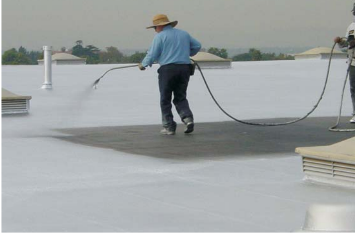
Upon drying, a highly reflective asphalt aluminum coating is applied.