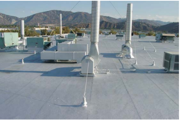
This finished WeatherWeld Seamless Composite membrane has 1.5 times the amount of reinforcement of a 4 ply BUR; over twice the thickness of a single ply, and 10 times the tear strength of a polyester and emulsion system!