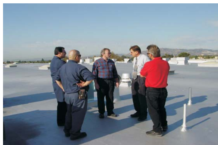
At the final job walk, three members of the facility's management team, the contractor and the property management company's consultant enjoy the results. For your company's piece of mind, call us at 888-440-3224.