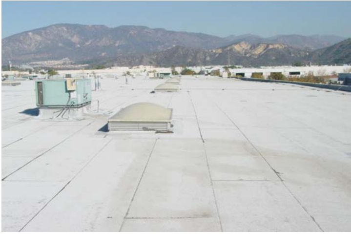
Project, 150,000 square feet of BUR set in hot asphalt, mechanically attached to a plywood deck. Building is used to manufacture vitamins...must be kept very clean!