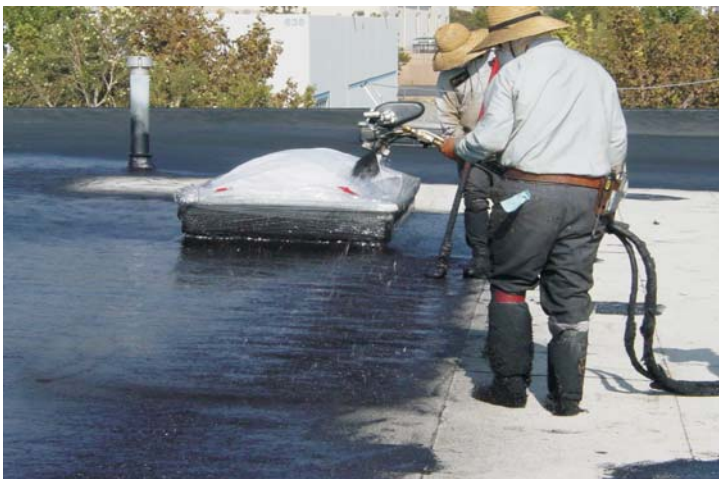
Since a tear-off was not an option, and VOC's, odors and dust were a major concern, the facility's management team selected the WeatherWeld Seamless Composite System.